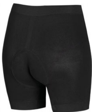
ALL MOUNTAIN pad